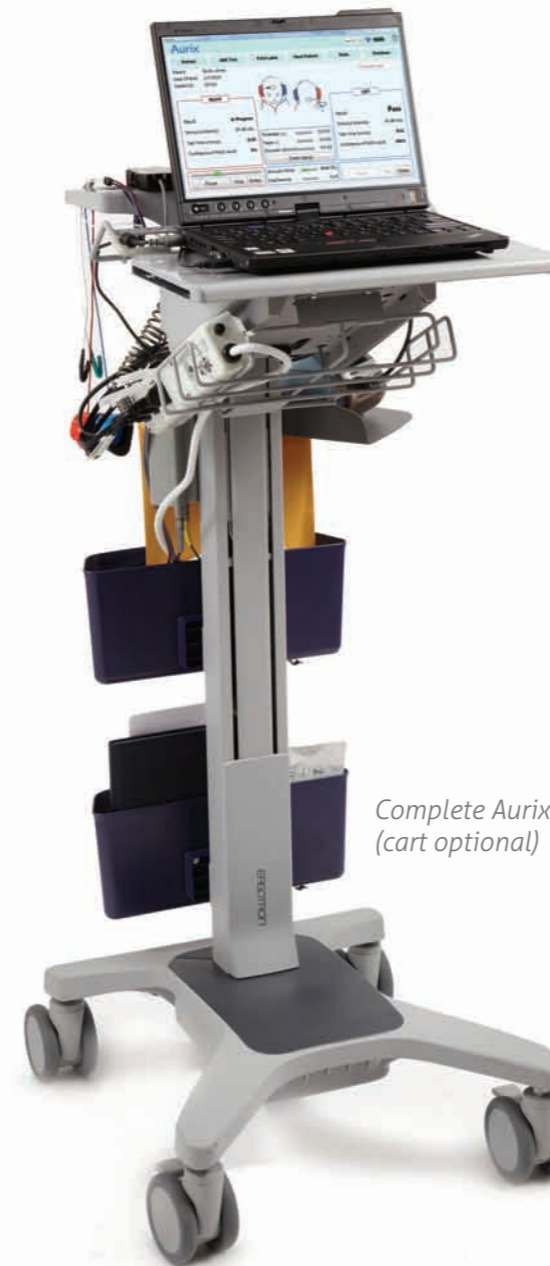
Complete Aurix System (cart optional)