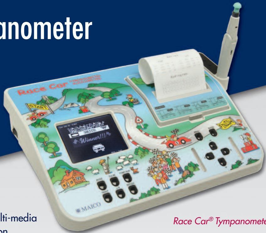
Race Car ® Tympanometer

The only tympanometer specifically designed to capture and keep your young patient's attention.