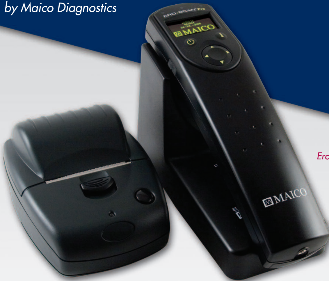
EroScan Pro Pictured