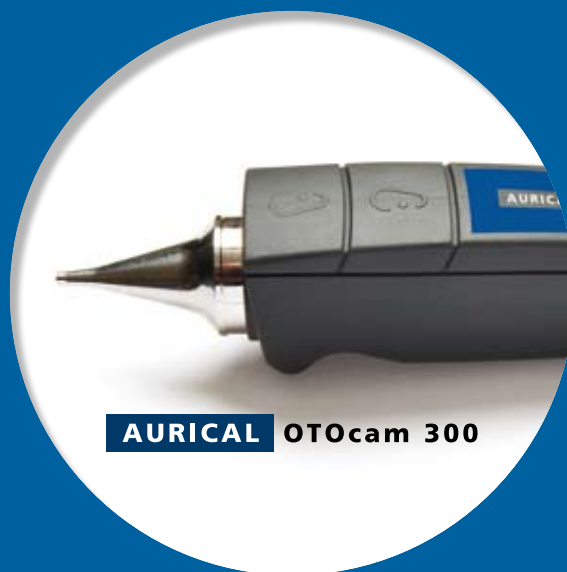
AURICAL OTOcam 300