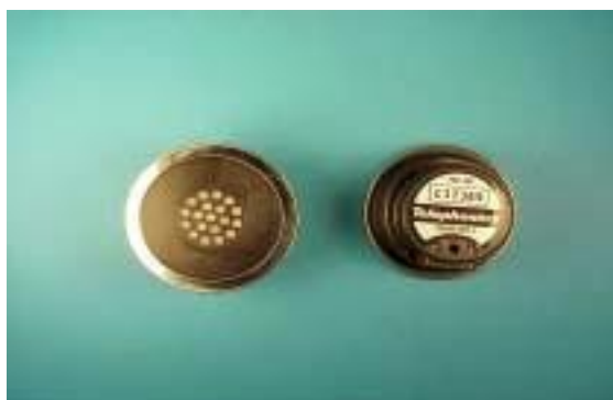
296D000-1 THD-39 (10 OHM) Phone (needs calibration) 296D100-1 THD-49 (10 OHM) Phone (needs calibration) 296D200-1 THD-50 (60 OHM) Phone (needs calibration)