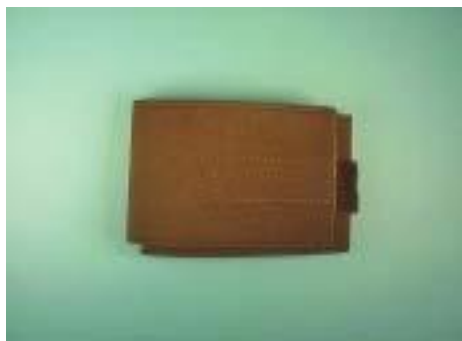
1700-9642 GSI-33 Wrist Probe Mount

Please Contact The Trilogy Audiometrics Supplier For Your Location