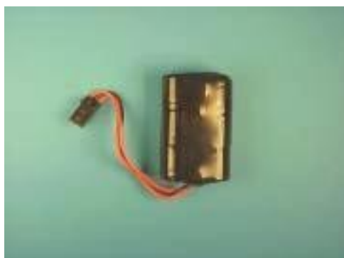
1737-0410 GSI-37 NICAD Battery