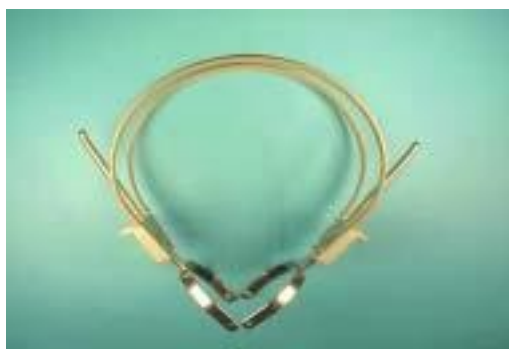
1037-28 Maico Pediatric Headband (Gray)