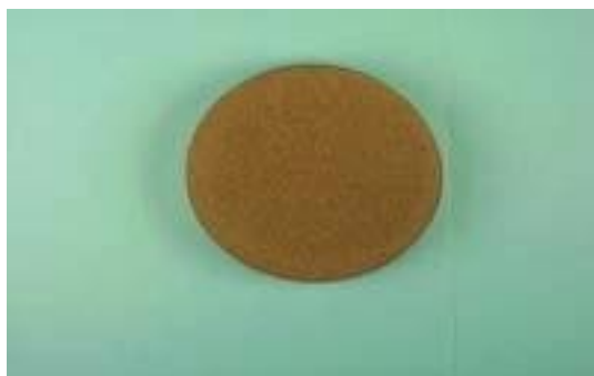
8000-0191 GSI-16 Grey Foam Cushion (for operator headset)