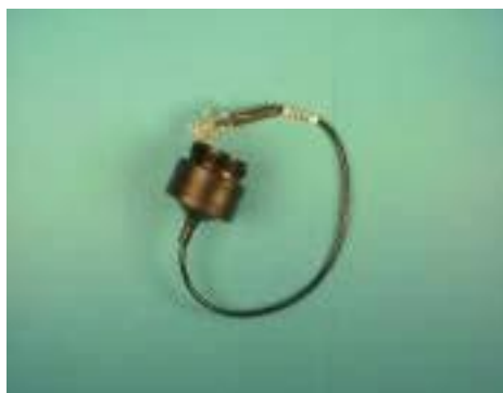
1737X Microphone – Coupler (Exchange)