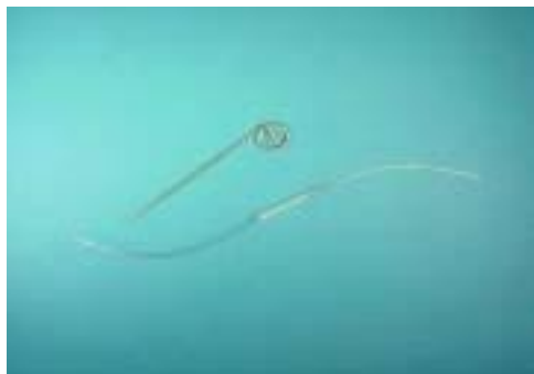
1760-9610 GSI-60 Cleaning Kit