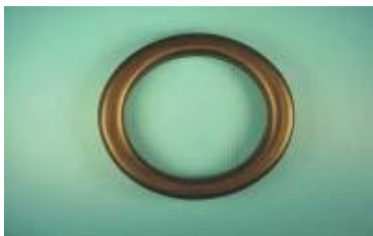
21914 Audiocup Cushions