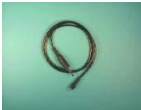
1733-0221 GSI-33 Contra Phone Cord

Please Contact The Trilogy Audiometrics Supplier For Your Location