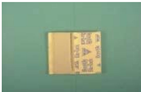
PUTTY Audioscan Putty

Please Contact The Trilogy Audiometrics Supplier For Your Location