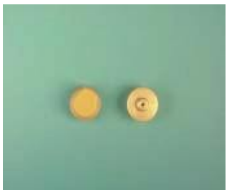
8000-0035 GSI-33 100ohm Insert Phone