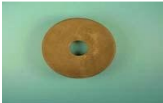
MX-41-AR Phone Cushions

Please Contact The Trilogy Audiometrics Supplier For Your Location