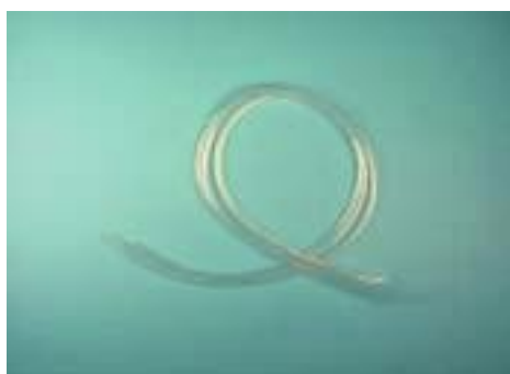
2000-9617 GSI IPSI Tubing Kit