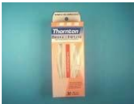
2000-9610 GSI-33 Cleaning Kit