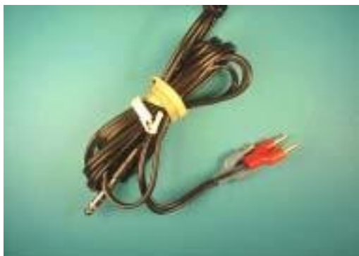
4204-0035 "Y" Phone Cord