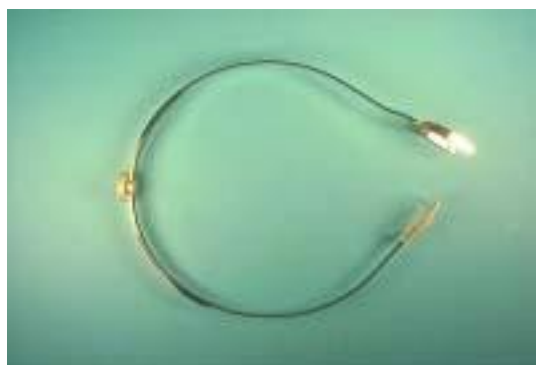
5760X Adjustable Bone H/B (Clear End)