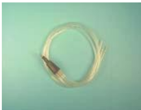
GSI Replace IPSI Tip/Tubing