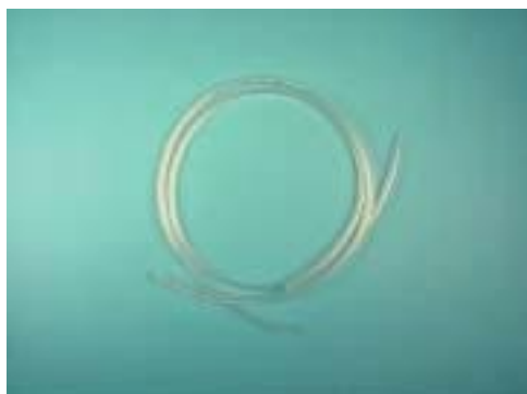
1760-9617 GSI-60 Tubing Kit