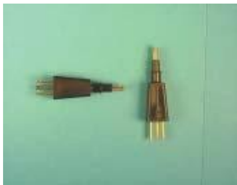
2000-1010 GSI IPSI Probe Tip

Please Contact The Trilogy Audiometrics Supplier For Your Location