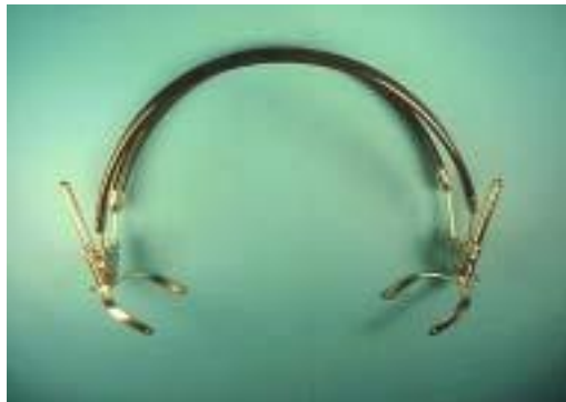
240921 Telephonics Headband (Black)

Please Contact The Trilogy Audiometrics Supplier For Your Location