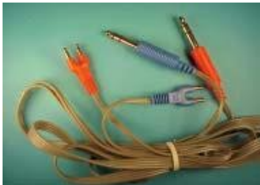
2168 Maico Stereo Phone Cord

Please Contact The Trilogy Audiometrics Supplier For Your Location