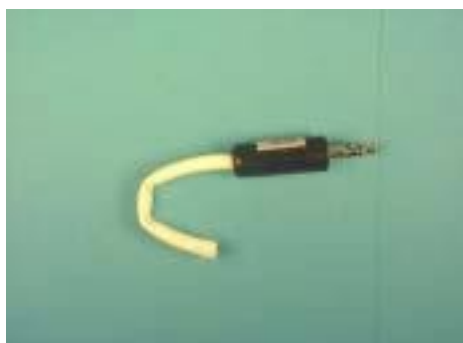
1768 HAT Reference Microphone