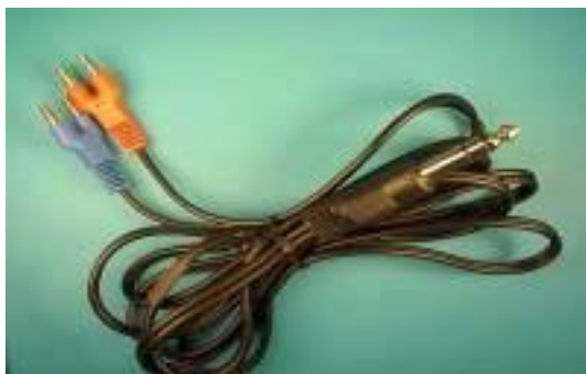
6005 Earscan Cable