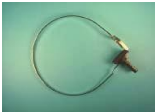
P3333 Bone H/P for B-71 (Dark End)