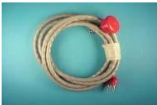
4204-0160 GSI Red Earphone Cord 4204-0161 GSI Blue Earphone Cord