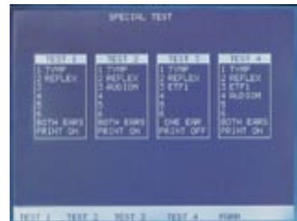
It is easy to select one of the test sequences that is pre-programmed by the user.