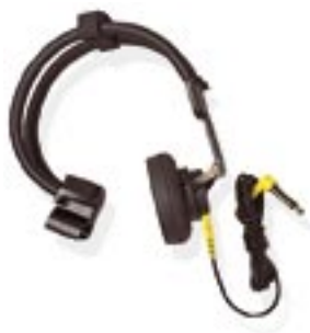
A clinical headband is included with the AZ26.

When used with the headband the probe tip itself can be detached enabling self-suspended positioning in the ear. This arrangement provides the greatest possible accuracy which is particularly important in the clinical evaluation of small deflection reflexes and in decay recording. Fitting the eartip to the ear canal is assisted by status indicators on the instrument's LCD screen as well as on the probe itself.