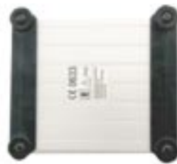
Camera Control Box